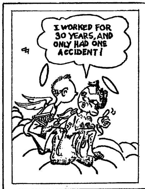
—National Safety Council