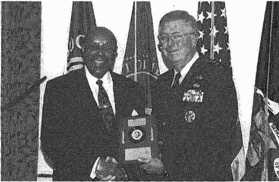
Congressman Louis Stokes accepts plaque from DIRNSA

on behalf of the men and women of the NSA/CSS in appreciation of your outstanding leadership and numerous contributions to the security of the Nation as Chairman of the House Permanent Select Committee on Intelligence (1987-1988) and as the architect of the Intelligence Community's Undergraduate Training Program. The National