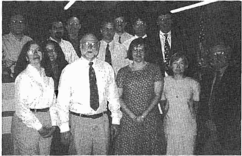
Members of the Research and Technology Forecast '98 Team