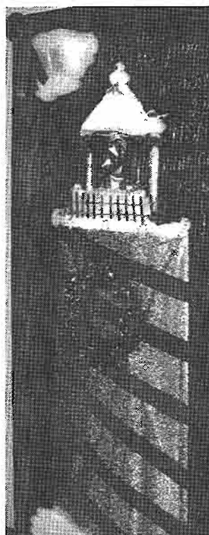
Your Guiding Light