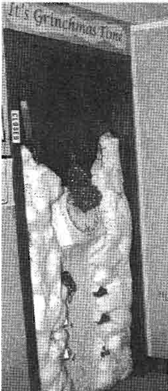
It's Grinchmas Time